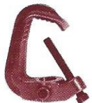
Type 1201 C-Clamp